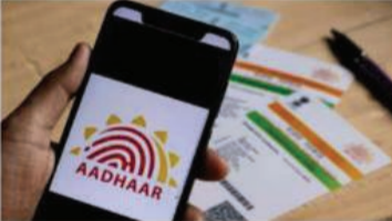
Aadhaar goes fully digital with new mobile app launch

This new Aadhaar app marks another step in India's ongoing journey toward a smarter, secure, and digitally empowered future.