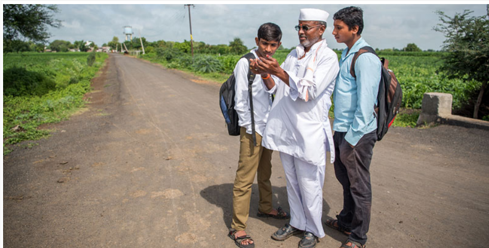
A long road to development and progress.

And yet, we hear so much anti-Aadhaar news. So why would anyone oppose Aadhaar? There are people with vested interests or extreme ideology – they do not want corruption to go away, they are middlemen who have been making crores through corrupt practices, or they believe in extreme anti-state ideologies.