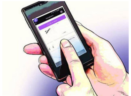
The proxy authorisation option will see a person nominated by a senior citizen verifying Aadhaar linkage for the mobile user.

"It does not even mention that we have time till February next year. I am already being bombarded by the operator to do it immediately, or face disconnection. Is this fair?" the Delhi-based customer said. "Besides, there is major trouble for people living in rural, hilly or smaller towns. Telecom service centres are located at faraway locations and it may not always be feasible for customers to go again and again," said another customer.