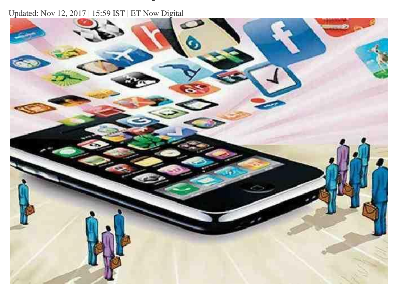
UMANG app provides a single platform for all Indian citizens | Photo Credit: Indiatimes, Representative Image

New Delhi: With digitisation, accessing Provident Fund (PF) details, booking a gas cylinder refill, and accessing the National Pension System is just a click away.