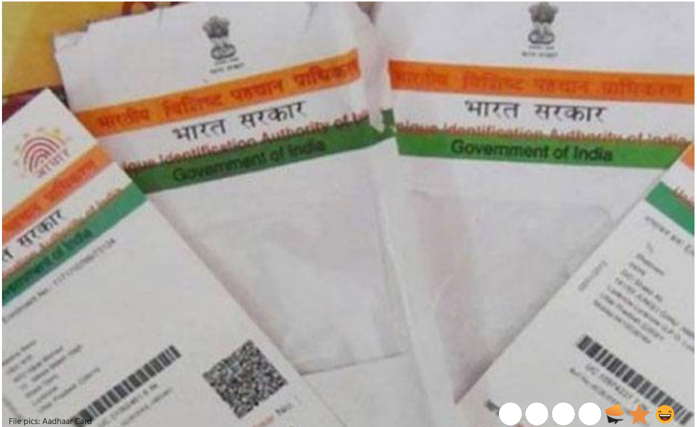
File pics: Aadhaar Card

By PTI ( http://www.newsnation.in/byline/PTI ) | Updated On : February 04, 2017 07:34 PM