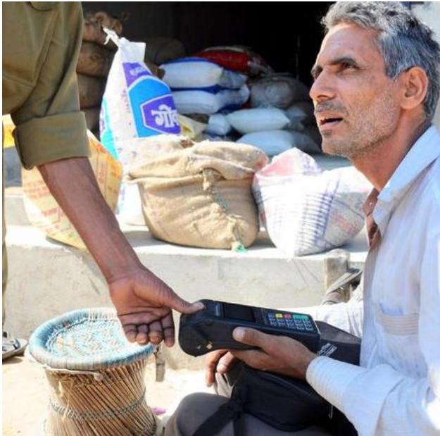
Authenticated Though doubts have been raised about the safety of fingerprint data, officials insist that the biometrics are secure