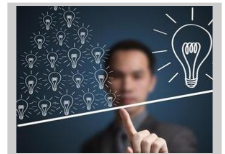
Small Business Ideas

Printable version | Mar 16, 2017 1:06:58 PM | http://www.thehindubusinessline.com/specials/india-file/aadhaar-the-12digit-conundrum/article9582271.ece © The Hindu Business Line